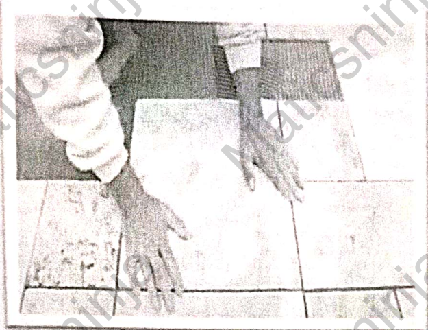
Figure 15.1: flooring materials